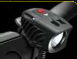
MiNewt Pro 750