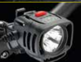
PRO 1800 LED