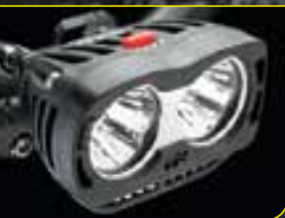
PRO 3600 LED